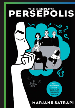
The Complete Persepolis BY Marjane Satrapi